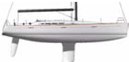
Deep draught keel