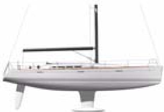
Shallow draught keel