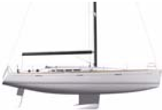
Short draught keel